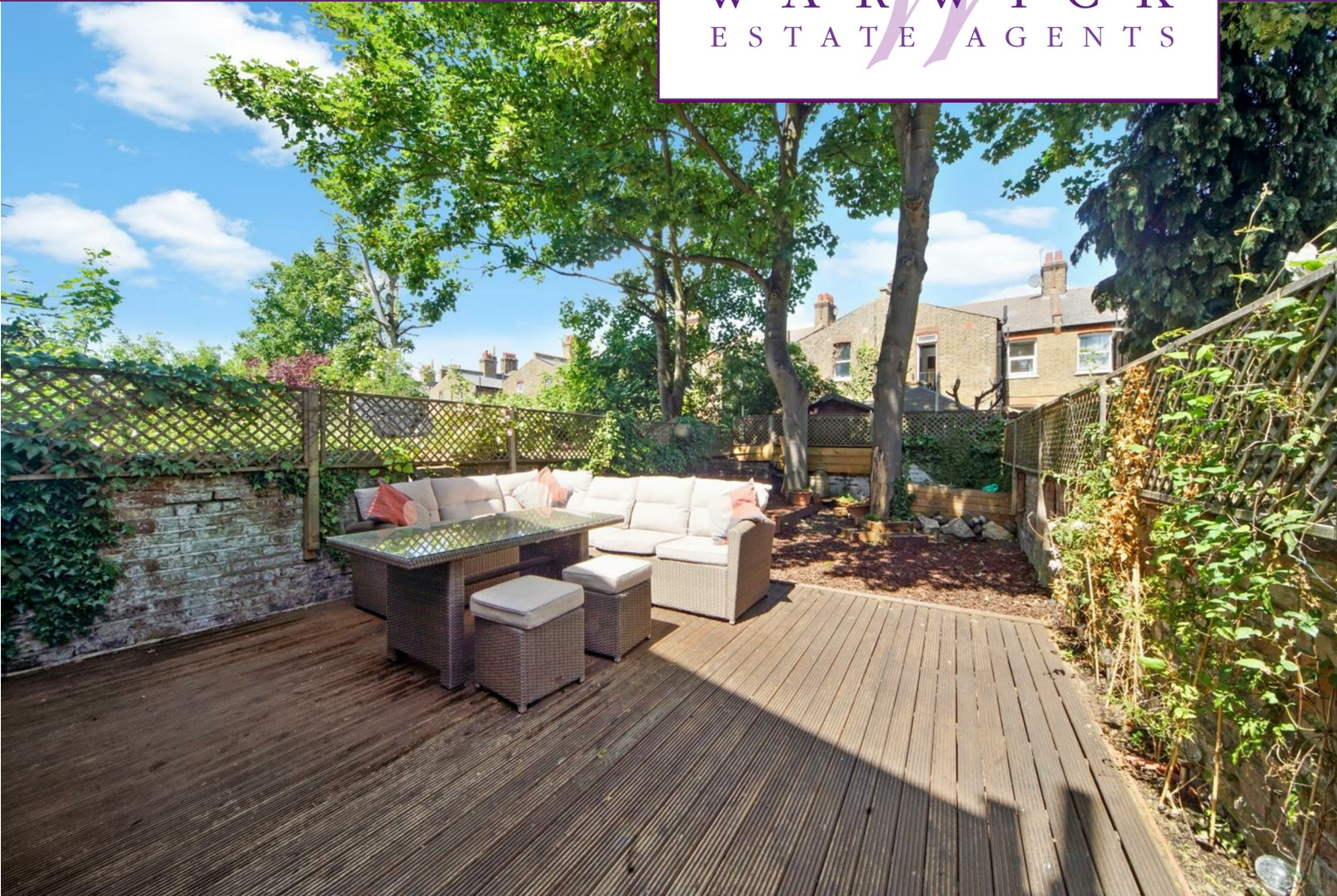
Kilburn Lane, Queens Park, W10 4AX